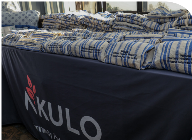
Donated items included endoscopic clips, bag draw and fitted bed sheets, pillows, pillowcases, blankets, pyjamas, nightdresses, and small bedspreads.

The hospital is a critical facility serving the entire Nkangala district. It admits 20 high-care patients daily, many of whom require prolonged stays due to severe medical conditions.