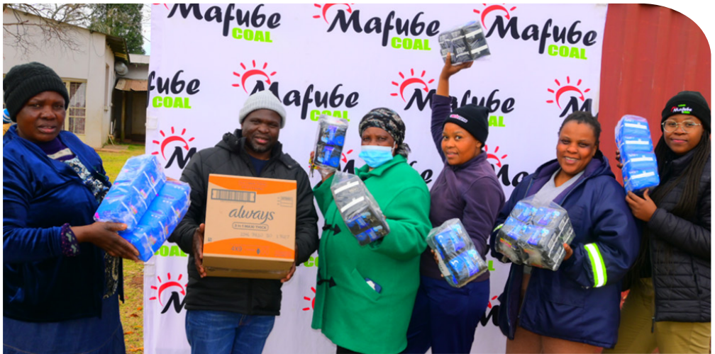
kokuphazamiseka nanokuzinakekela ngokuphelele.