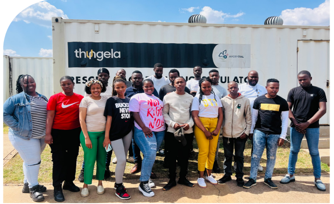
Abafundi ababili sebeyingxenye yohlelo lwethu lwelearnership

Ngo2023, iZibulo Colliery yethule uhlelo lokuqeqesha intsha olubizwa ngecadetship programme. Loluhlelo luqeqeshe amalungu omphakathi angu20 ukusebenzisa imishini esetshenziswa ngaphansi emgodini. Ezinyangeni ezingu-4, abakulolu hlelo bese bethole isipiliyoni esihle. Ngokubona ukuthi abaningi kubo abanawo umatikuletseni, sibasekile ngeNational Accredited Technical Education Diploma (iNATED) esizoqedwa. Ngenxa yalokhu, u85% wabo usunozitifiketi zikaN2 kanti manje usubhalisele uN3.